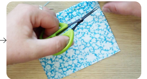
Tie a knot at the end of the hem and cut the thread. Iron along the crease to flatten the hem.