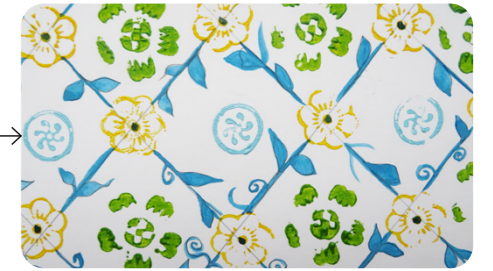
Repeat with other blocks and colours until the pattern is complete.